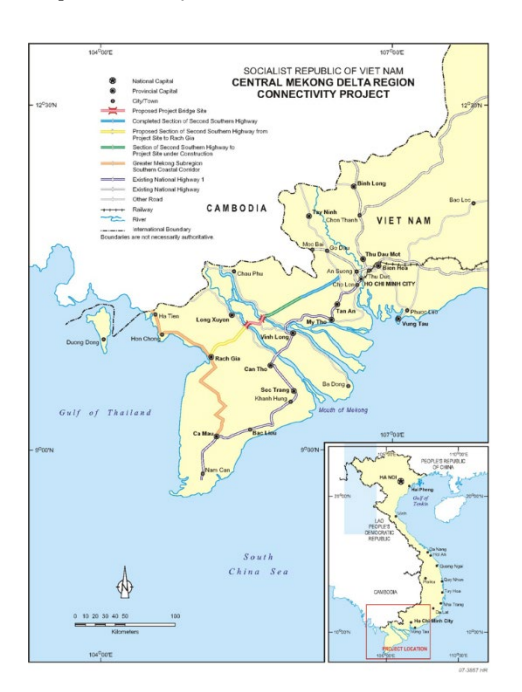
Figure: Road plan for the Mekong Delta region

Mekong Delta Region Socio-economic Development and National Defense Security announced in June 2022, the government aims to double the per capita GRDP (gross regional product) by 2030.