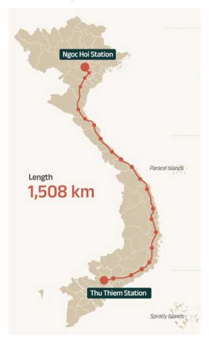
Figure Hanoi - Ho Chi Minh North-South High-Speed Railway Project

trains, and 20 stations for freight trains. (b) ETCS Level 2 will be adopted for the railway operation system, and the total investment is expected to be 64.8 billion USD. (c) The necessary funds will be raised through public